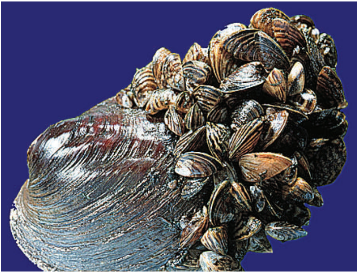
Zebra Mussels Impacting Native Clam