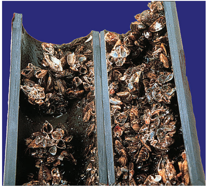
Zebra Mussels Impacting Water Intake

The zebra mussel ( Dreissena polymorpha ) is a small, non-native mussel originally found in Russia. In 1988, this animal was transported to North America in the ballast water of a transatlantic freighter and colonized parts of Lake St. Clair. In less than ten years, zebra mussels spread to all five Great Lakes and into the Mississippi, Tennessee, Hudson, and Ohio River basins. Many inland waters in Michigan are now infested with zebra mussels. Only one lake was infested in 1992; today there are over 100. Zebra mussels are very successful invaders because they live and feed in many different aquatic habitats, breed prolifically (each female produces 1 million eggs per year), and have both a floating larval stage and an attached adult stage. Young zebra mussels are microscopic. They are the size of the diameter of a human hair and are invisible to the naked eye. Because young zebra mussels are so small, they are spread easily by water currents and can drift for miles before settling. Adult zebra mussels are larger (< 2 inches in length) and attach to hard objects and remain stationary. They often attach to objects involved in human activities, such as boats and boat trailers, and are inadvertently moved from one water body to another by people.